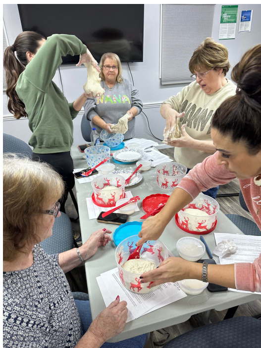
Sourdough class participants