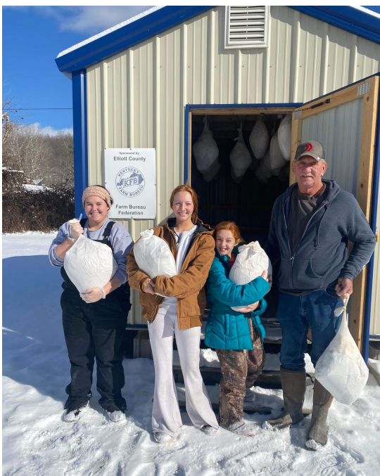
4-H Country Ham participants

Number of youth engaged in FCS 4-H programming