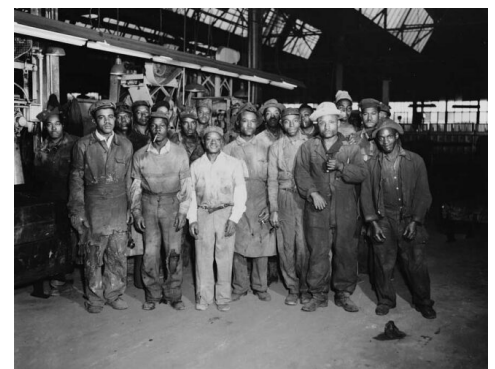
Black laborers at Stockham Pipe and Fittings Company in Birmingham in 1950.

The Southern economic development model cannot create shared prosperity. To uplift everyone in the South, we need policies that raise wages, make taxation fair, strengthen the safety net, and protect workers' right to unionize.