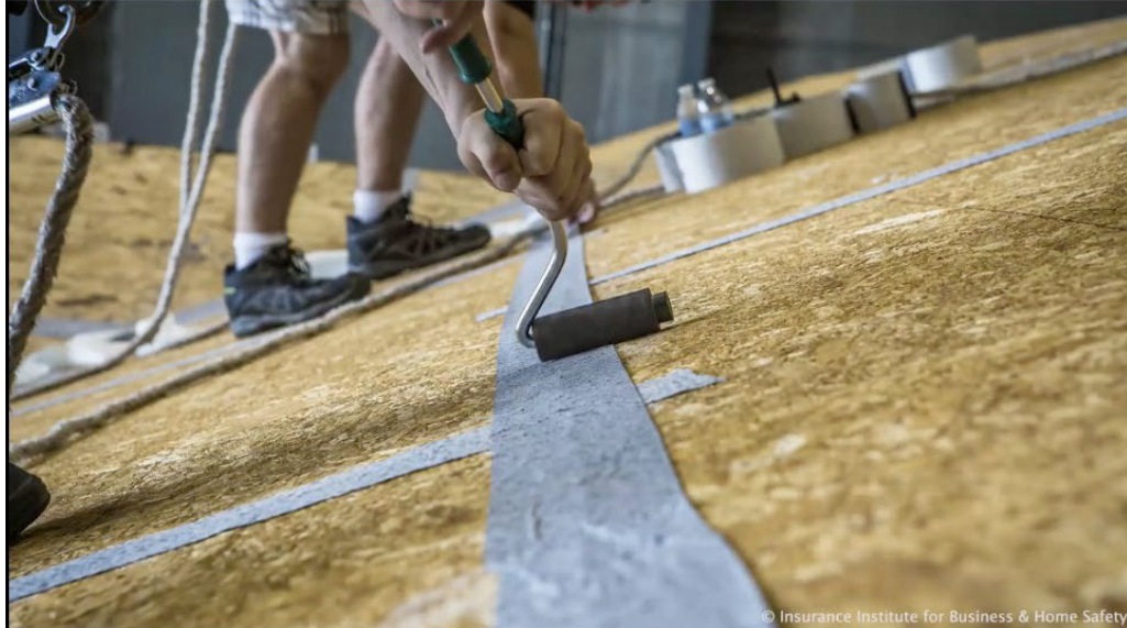
Figure 2: Installing a sealed roof deck system; taping the seams of roof sheathing.

Sealed Roof Deck Option 2- Self Adhered Membrane: Cover the entire roof deck with a full layer of self- adhering polymer-modified bitumen membrane meeting ASTM D1970 requirements. This approach provides a waterproof membrane over the entire roof and can greatly diminish the potential for leaks. In some instances, the ability of the self-adhered membranes to adhere to oriented strand board (OSB) sheathing may be compromised by the level of surface texture or wax used in fabricating the OSB panels. In applications where membrane adhesion to OSB is marginal, apply a manufacturer-specified compatible primer to the OSB panels to ensure the proper attachment of the self-adhering membrane to the sheathing.