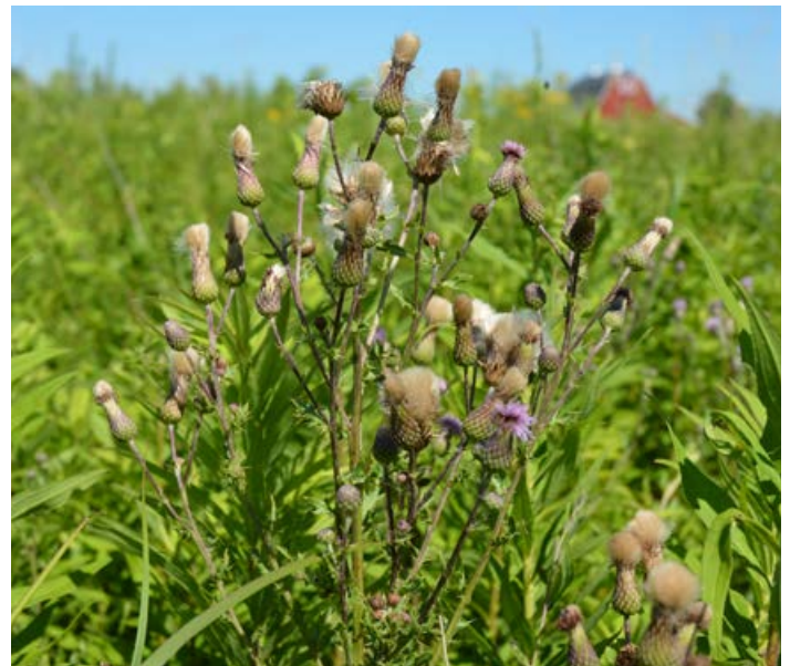
Nonnative biennial (musk thistle; left photo) and perennial (Canada thistle; above) thistles commonly invade NWSG stands and are most effectively controlled with herbicide.