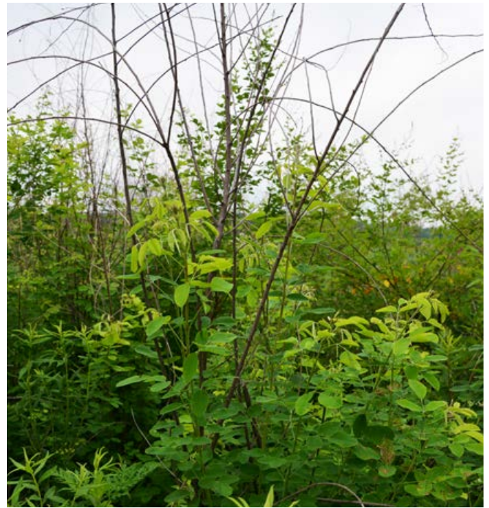
Shrub lespedeza commonly invades NWSG stands in the southern United States and the use of prescribed fire only enhances its invasiveness. Herbicide should be used to control invasions.

Shrub lespedezas. Federal, state, and non-governmental conservation organizations often cultivated, promoted, and planted bicolor lespedeza, Thunberg lespedeza, and other shrub lespedezas to provide woody cover and seed for northern bobwhite. Make no mistake, shrub lespedezas are NOT needed to manage for northern bobwhite! More common in the southern United States, shrub lespedezas are very invasive and form dense thickets in NWSG stands and throughout woodlands where prescribed fire is used. The invasive nature of this plant quickly shades-out desirable plants. Shrub lespedezas are still cultivated and sold, but are no longer recommended for wildlife, and many states consider them an invasive plant. Prescribed fire is not an effective tool to manage shrub lespedezas because of resprouting, and prescribed fire can enhance the germination of shrub lespedeza seed leading to further invasions. Shrub lespedezas are controlled with applications of triclopyr (Garlon 4®, 4–8 qt/ac), metsulfuron methyl (2–3 oz/ac), or glyphosate (3–4 qt/ac).