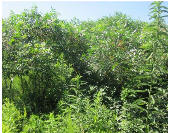
Sumac mottes provide excellent thermal cover during the heat of the summer for bobwhite, turkeys, and white-tailed deer. However, sumac can become too dense if not managed.

Native shrub species, such as plums, hawthorns, elderberry, dogwoods, sumacs, leadplant, and false indigo, are extremely attractive to many wildlife species that need woody cover and make planted NWSG fields much more desirable to these species. However, you need to provide the correct amount of woody cover in an attractive arrangement for various focal species, and as succession advances, even some of these shrubs can become too dense for various species and management will be needed to control them.