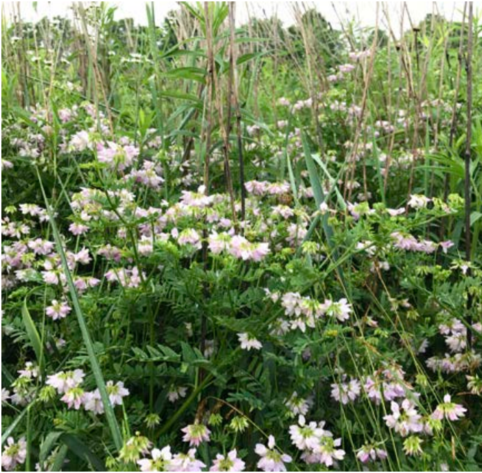
Crown vetch is commonly found along roadsides, but also invades NWSG stands.

Crownvetch is a nonnative perennial legume often promoted for erosion control and as a forage for cattle. However, crownvetch is very invasive and quickly invades NWSG stands. Eventually, crownvetch will outcompete native vegetation and form a monoculture. Crownvetch is a cool-season plant and can be controlled when most desirable warm-season vegetation is dormant. Crownvetch is best controlled with products containing triclopyr (1qt/ac), metsulfuron methyl (0.5 oz/ac), or aminopyralid (5–7 oz/ac). Small infestations also can be controlled with glyphosate (2 qt/ac) or 2,4-D (4–6 pt/ac).