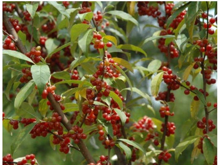
Nonnative olives are commonly spread across NWSG fields by birds dispersing seed. Olives can quickly invade open areas and they should be controlled with herbicide.

Nonnative olives. Nonnative olives (autumn, silverthorn, Russian, and others) are woody shrubs commonly planted in the mid-20th century to provide cover and food for wildlife. When occurring adjacent to a NWSG field, they usually spread throughout the field and may create dense thickets within the field, which can be desirable for some wildlife species, but they are problematic as an invasive species. Nonnative olives can be controlled with foliar applications of triclopyr (Garlon 4®, 4–8 qt/ac) or imazapyr (Arsenal®, 4–6 pt/ac), whereas glyphosate and metsulfuron methyl typically provide limited control.