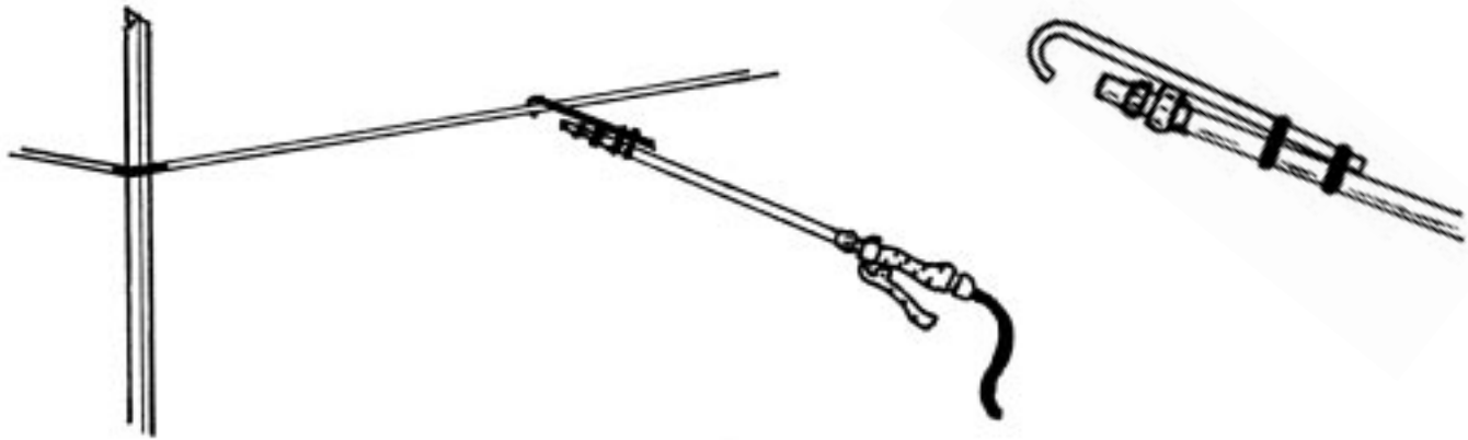
Figure 2. A hook attached to the sprayer nozzle aids in directing the repellent onto the fence.