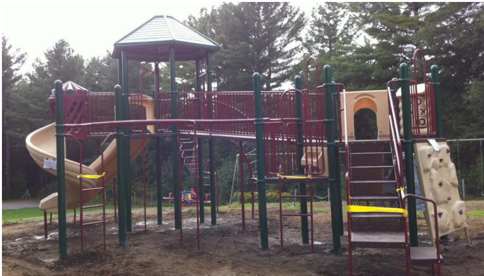
Lakeview Elementary School Playground