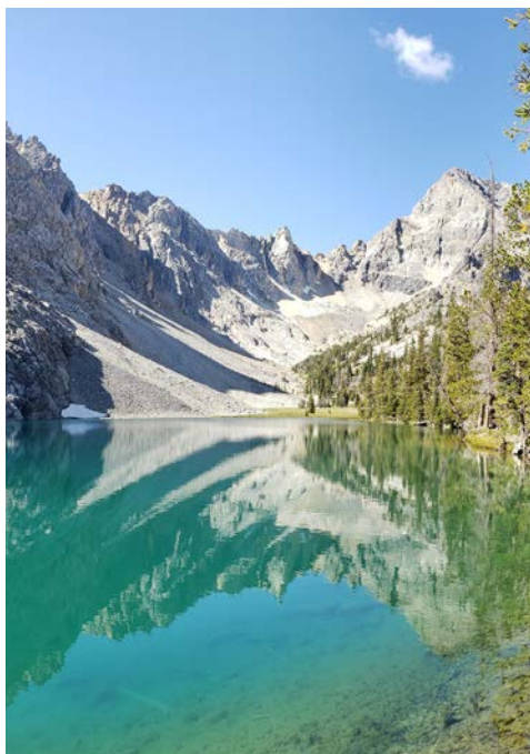
Bottom: Looking back on the Merriam Lake basin after completing the survey.