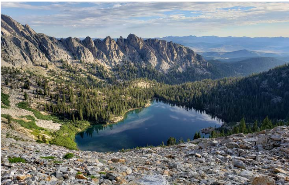
Top: Male Black Rosy-finch Bottom: Alpine Lake, in the northern end of the Sawtooths. This is a view from the top of the survey within the basin above the lake.