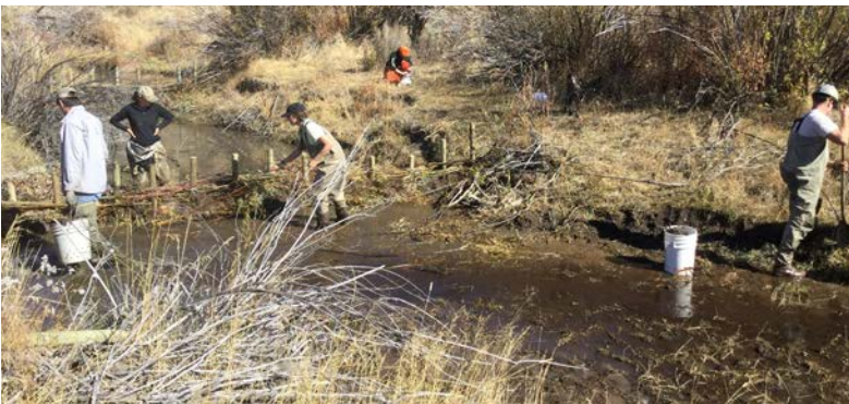
Above: A crew of biologists and volunteers work to construct a beaver dam analog (BDA) by using locally sourced materials woven between wooden posts sunk into the creek bottom. The BDA will work to slow down and spread out water, creating a healthier riparian area and improving habitat for wildlife and fish species.