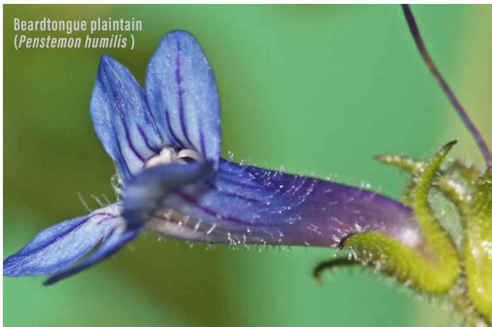
Beardtongue plantain ( Penstemon humilis )

You can help us reestablish these valuable cool air microrefugia. Idaho Fish and Game is launching a citizen science program aimed at collecting wildflower seeds from local North Idaho sources, which will be planted in our restoration areas. Why local seeds? Plant populations become adapted to local conditions, affecting the timing of their seed germination and determining whether they live... or die. And the abundance and diversity of our local wildflowers are the roots of existence for our indispensable bumblebees.