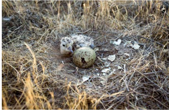
Long-billed curlew chick and nest.

The fallout is particularly severe for curlews, Carlisle says. The species is long-lived, but the birds reproduce just once a year, have relatively small clutch sizes of 3-5 eggs, and must fend off predators for more than a month until their young can take flight. Those factors account for curlews’ aggressive and showy defense behavior—which is no match for a rifle or shotgun. They also mean that poaching of breeding-age birds could account for the cascading drop in curlew numbers in southwestern Idaho.