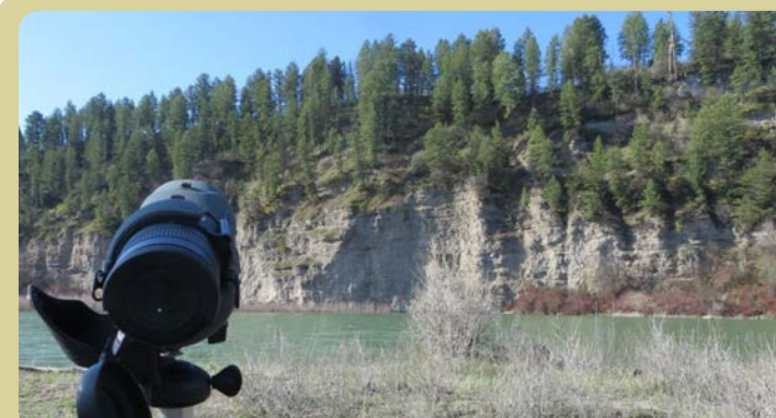
Spotting scopes and binoculars are useful tools for observing peregrine eyries.

Though peregrine falcons are now considered a Species of Least Concern, they were listed as an Endangered Species from 1970-1999. The use of pesticides such as DDT across the U.S. in the 1940s-1970s caused the eggs of birds to have thinner shells, including peregrine falcon eggs, resulting in extremely low hatch-rates and a population crash. Fortunately, through intensive captive breeding and release programs and the banning of DDT in 1972, peregrine falcon numbers have rebounded, representing one of the Endangered Species Act’s greatest successes. Peregrines have even adapted to inhabit urban areas, using skyscrapers as surrogate cliffs to nest on and hunt from. Downtown Boise has a breeding pair of peregrines that use one of the tall buildings as a nest site location!