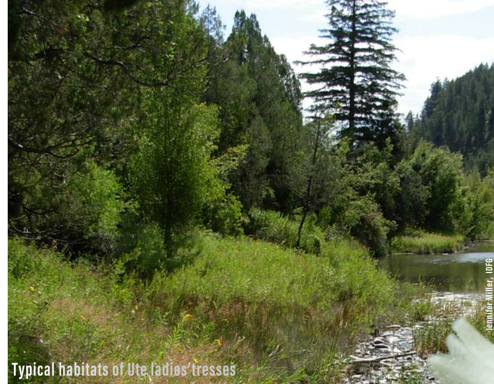
Typical habitats of Ute ladies'-tresses