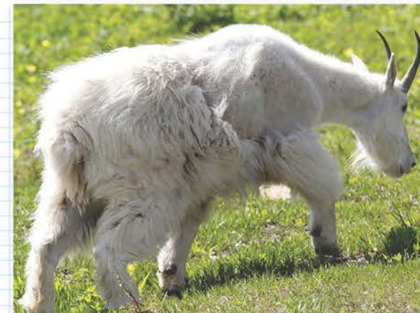
Jul 26, 2012 · 1:52 PM PDT Logan Pass, Glacier NP, MT; Lat: 48.688807, Long: -113.732786

WE CAN USE YOUR PHOTOS TO EVALUATE GOAT MOLT: