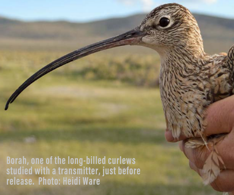
Borah, one of the long-billed curlews studied with a transmitter, just before release.