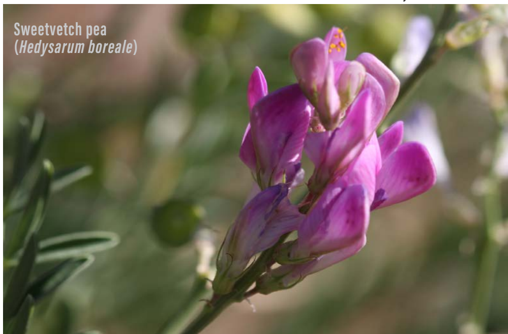
Sweetvetch pea ( Hedysarum boreale )

This program is spreading its wings with the help of many local experts from North Idaho's native plant societies, native plant nurseries, natural resource agencies, and non-profit organizations. There are various ways to participate: