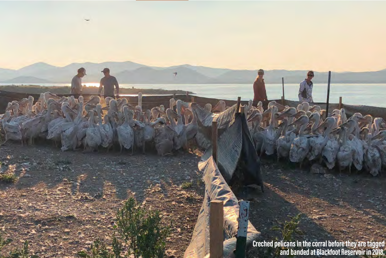
Creched pelicans in the corral before they are tagged and banded at Blackfoot Reservoir in 2018.

Your support at work in Idaho's landscapes