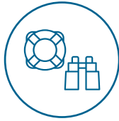
Search & Rescue