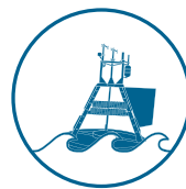
Deep Water Moorings