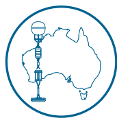
National Mooring Network