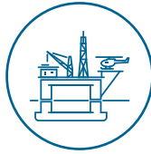
Oil & Gas Industry