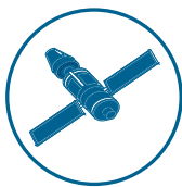
Satellite Remote Sensing