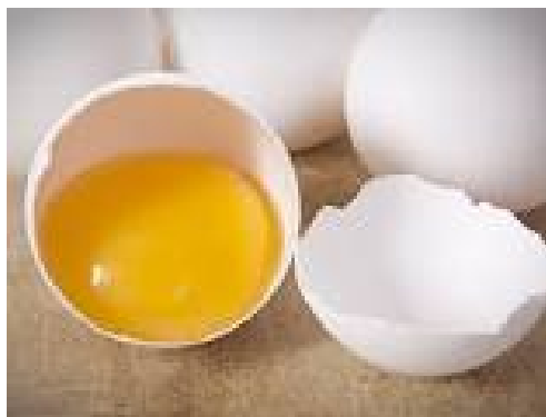
Table egg exports for June 2020 were 11.6 million dozen, up 0.4% from the same month of last year, while export value was $8.2 million, up 3.9%. June exports to Mexico increased by 154% year over year to 5.2 million dozen, while exports to Hong Kong decreased by 35.2% to 3.8 million dozen and exports to Canada dropped by 97.8% to merely 56,224 dozen. Shipments to the U.A.E., Oman, Guatemala, and Bahamas increased.

Cumulative exports of table eggs for January through June this year were 65.0 million dozen, up 1.5% from the same period a year earlier, while export value reached $59.2 million, up 14.7%. Of the total shipments, 91.3% or 59.4 million dozen were shipped to the top six export markets, namely Hong Kong, Mexico, Canada, the U.A.E., Bahamas, and Israel.