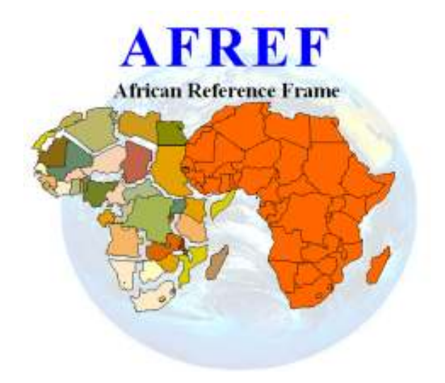
Figure 2: AFREF logo launched at the technical workshop held in July 2006

Although the ideals and concepts of AFREF have been debated for a number of years, the scientific and technical aspects of the project had never been highlighted in a dedicated workshop. The possibility of South Africa hosting such a technical workshop was raised at a United Nations Office for Outer Space Affairs (UNOOSA) meeting in Vienna in December 2004. A small Local Organising Committee was constituted and the University of Cape Town was selected as the most appropriate venue. The workshop was initially planned for January / February 2006 but, because of insufficient funding at the time, was postponed to July 2006. The University of Cape Town and the Chief Directorate: Surveying and Mapping jointly organised the first AFREF Technical Workshop in July 2006, relating to the establishment of the African Geodetic Reference Frame. Delegates from 24 countries attended. 38 representatives from 17 countries with a good geographical distribution throughout Africa were represented at the workshop. 4 representatives from 2 of the 3 regional centres for mapping in Africa also participated in the workshop viz. the Regional Centre for Mapping of Resources for Development (RCMRD) based in Kenya and the Regional Centre for Training in Aerospace Surveys (RECTAS) based in Nigeria. In addition to the above representatives from Africa, 15 speakers from a number of organisations outside of Africa gave presentations.