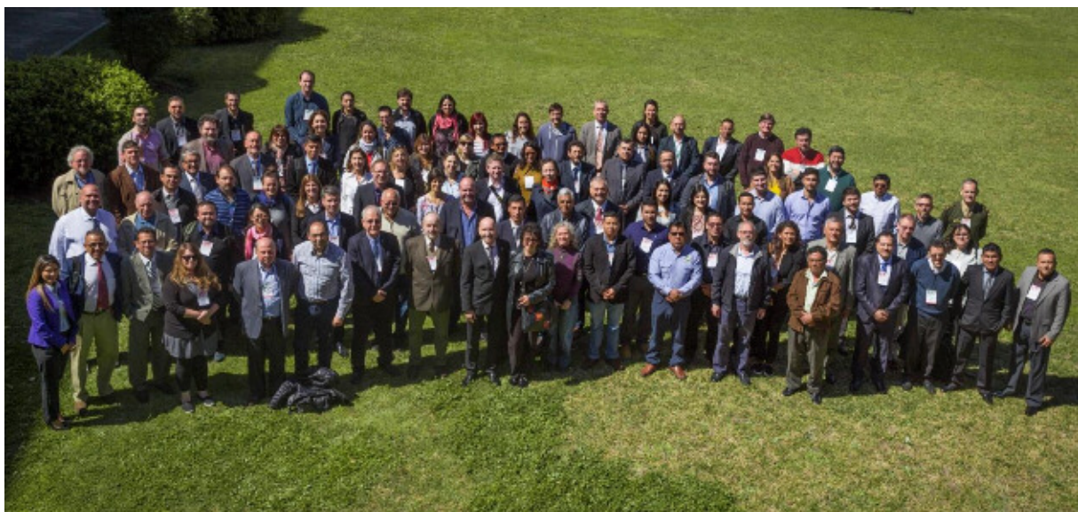
Attendants to the International Workshop for the Implementation of the Global Geodetic Reference Frame (GGRF) in Latin America. Buenos Aires, Argentina, Sep 16 – 20, 2019.

In total, 130 participants from 20 countries (Argentina, Australia, Bolivia, Brazil, Chile, China, Colombia, Costa Rica, Dominican Republic, France, Germany, Guatemala, Italy, Mexico, Panama, Paraguay, Peru, United States of America, Uruguay, and Venezuela) attended the workshop. With 52 presentations distributed in eight sessions, it was possible to bring together politics, international organisations promoting science, the highest level of expertise in Geodesy worldwide, and regional specialists in Geodesy to provide the Latin American colleagues responsible for the national geodetic reference frames with scientific and political arguments to convince policy makers about the necessity of investing in geodetic and geophysical infrastructure in their countries.