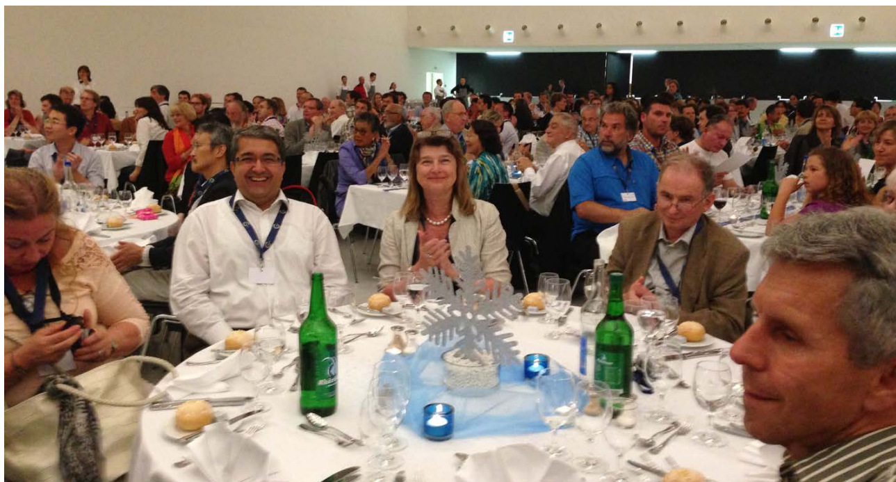
At the Davos Atmosphere and Cryosphere Assembly DACA-13, 8-12 July 2013

I enclose a picture from our DACA-2013 Atmosphere and Cryosphere Assembly meeting in Davos, remembering fondly past in-person meetings which were so pleasurable and rewarding. Let's hope for a future where we can all meet in person again!