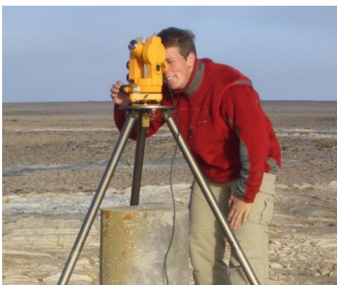
Measuring the geomagnetic field at a so-called repeat station in Namibia

I work at the German Research Centre for Geosciences (GFZ) in Potsdam, Germany, studying the main geomagnetic field originating in the Earth's core. The career path that took me there might seem straight at first glance, but in reality it involved lucky coincidences. Although I have spent over 20 years at the same institute I have many international collaborations and I very much enjoy the friendly and welcoming atmosphere in our global community.