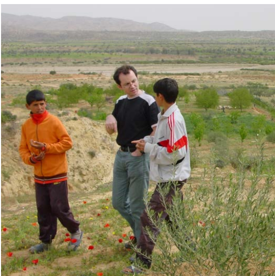
Field survey in Tunisia (2005)