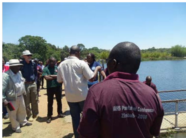
IAHS Panta Rhei workshop in Zimbabwe (2018)