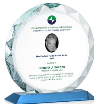
The crystal Vladimir Keilis-Borok Medal 2022