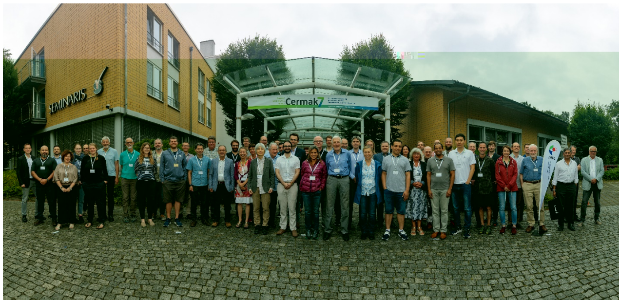
Participants of Cermak7

Additionally, a business meeting of the IHFC was held on Tuesday evening that addressed several issues: (i) the rules about member nominations and election, (ii) the structure of working groups within the IHFC, (iii) the preparation of a special issue to collect posters and presentations from the Čermák7, and (iv) the ongoing activities and the proposal for summer school on heat-flow determination hosted by GFZ a week before the 2023 IUGG General Assembly in Berlin.