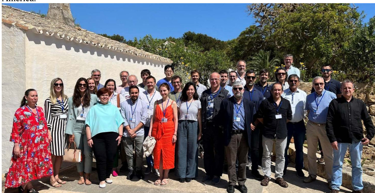
Participants of the 2nd World Conference on Meteotsunamis

Due to the persistent COVID-19 pandemic and, more recently, the war in Ukraine, participation was not as large as anticipated, involving 35 registered participants, mainly from Europe and North America.