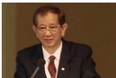
Yuan Tseh Lee