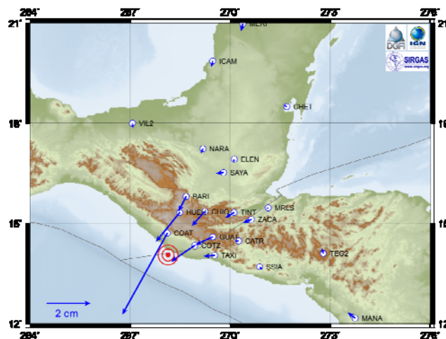
Horizontal displacements of the SIRGAS Reference Frame estimated after the 2012-11-07 Guatemala M7.4 earthquake

On November 7, 2012, at 16:35:46 UTC (10:35:46 local time) a strong earthquake (magnitude 7.4) shook the area located at the southern part of Guatemala, close to the city Champerico. The epicentre was estimated at 13.977°N and 91.876°W and the hypocenter at a depth of about 24 km. To estimate the crustal deformation caused by the earthquake, daily positions of continuously operating stations of the geodetic reference frame of the Americas (SIRGAS) and the Guatemalan geodetic network were computed between November 4 and 10. This processing includes reference stations of the International GNSS Service (IGS) located in North America, the Caribbean, Asia/Oceania and South America as fiducial points. The comparison of pre-seismic and post-seismic station positions shows the largest displacement (43 mm in S-W direction) at station COAT (Coatepeque) and the second largest movement (17 mm in S-W direction) at station HUEH (Huehuetenango). Movements larger than 6 mm were also detected at stations BARI (Huehuetenango), CHIQ (Chicaman), GUAT (Guatemala City) and COTZ (Santa Lucia Cotzumalguapa). The vertical displacements are in the order of the station position uncertainty, and therefore they are not significant.