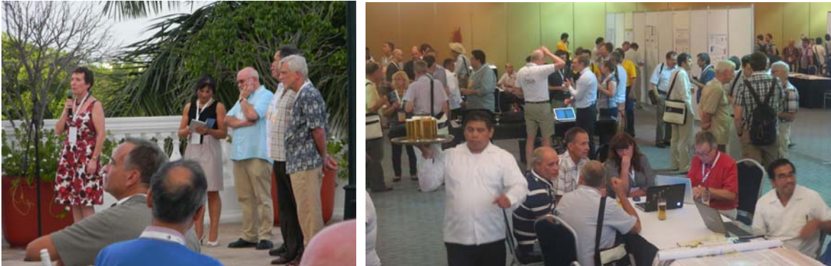
Award & Opening Ceremony (left) and poster session (right).