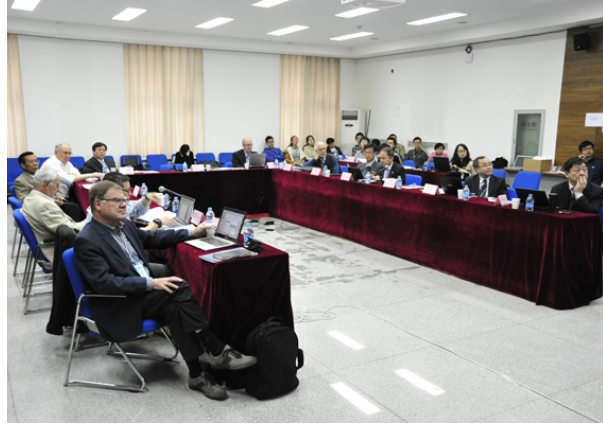
During the workshop