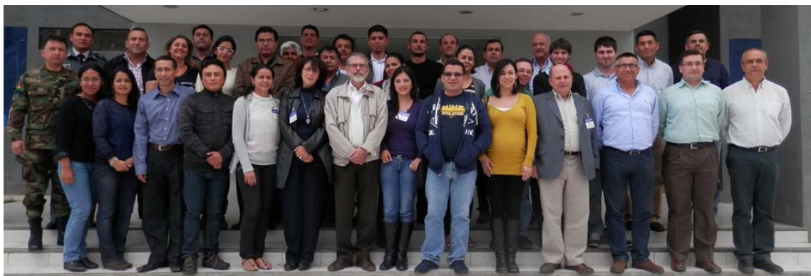
Attendees of the SIRGAS School on Vertical Reference Systems. La Paz, Bolivia, 20-22 November

The current activities, advances, and new challenges of SIRGAS are reported, discussed, and re-oriented (if required) in the annual SIRGAS Meetings, which have been held since 1993. In this series, the Symposium SIRGAS 2014 took place in La Paz, Bolivia from 24 to 26 November 2014. In the days prior to the Symposium (from 20 to 22 November), a SIRGAS School on Vertical Reference Systems was held. Both events were hosted by the Instituto Geográfico Militar of Bolivia.