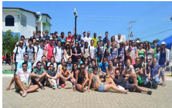
Young Scientists Excursion to sand dunes