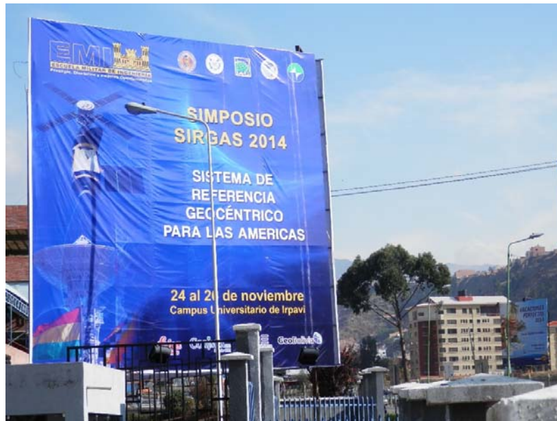
Welcome Symposium banner

provided with computation software, so the theory lectures were complemented by practical exercises.