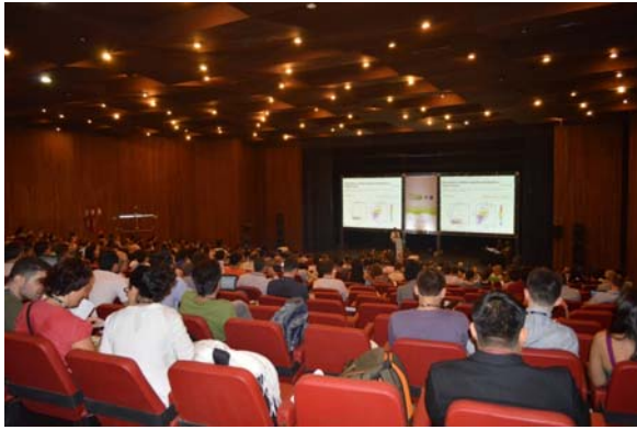
During oral presentation