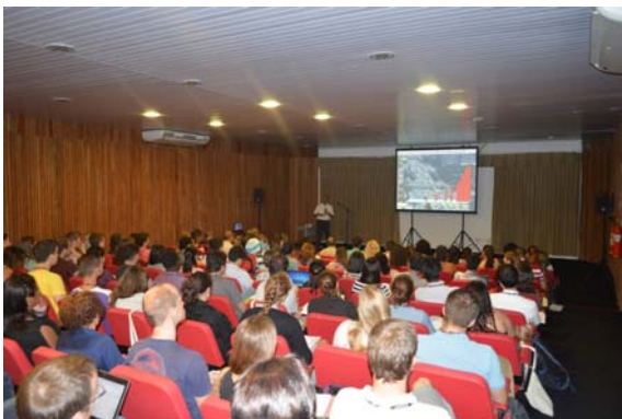
Young Scientists Workshop