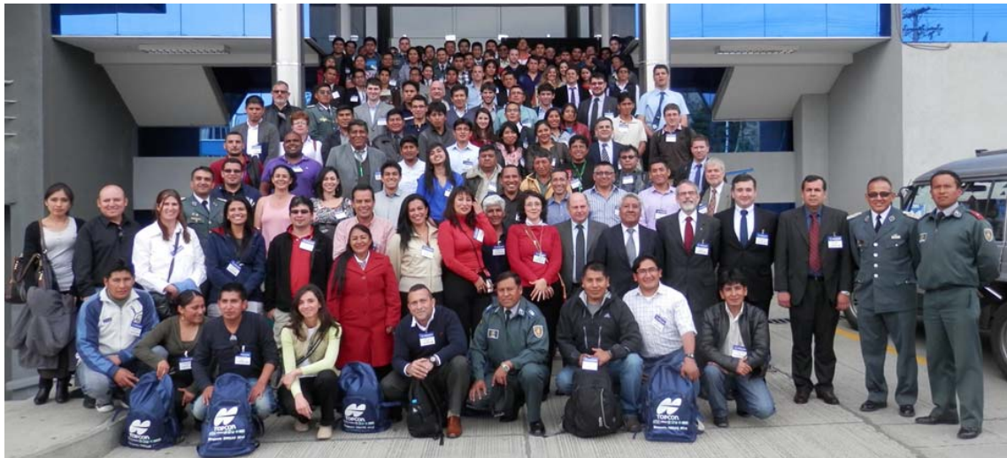
Attendees of the Symposium SIRGAS2014. La Paz, Bolivia, 24-26 November

The Symposium SIRGAS 2014 was attended by 260 participants from 19 countries (in addition to the School participants, Dominican Republic, Germany, Honduras, Mexico, Puerto Rico, and USA). In 39 oral presentations and 24 posters, the following topics were presented: Gravity and geoid modelling in the SIRGAS region, developments related to vertical reference systems and frames, geodetic estimation of geophysical parameters, report of the SIRGAS reference frame analysis centres, national reference frames and related applications, geodetic modelling of the Earth's crust deformations (in particular in the Andean orogeny), and practical usability of the SIRGAS reference frame. Presentations and extended abstracts of the contributions are available at the SIRGAS web site ( www.sirgas.org ).