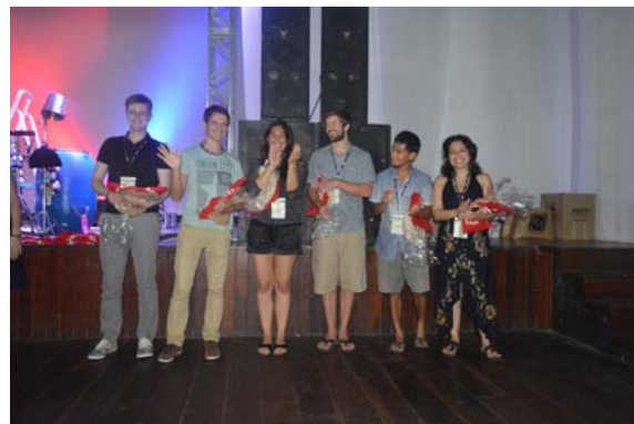
Young Scientists Poster Awardees