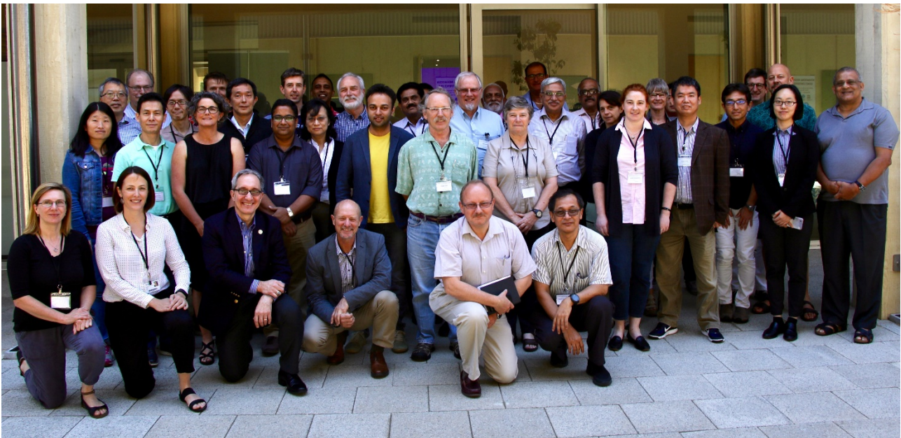
Participants to the IndoOS Review Workshop

From 30 January to 1 February, the CLIVAR/IOC-GOOS Indian Ocean Region Panel (IORP) met for its 13th session in Perth, Australia. The main agenda item of the meeting was the Indian Ocean Observing System (IndOOS) Review Workshop, jointly organized with the Sustained Indian Ocean Biogeochemistry and Ecosystem Research (SIBER) panel. The workshop consisted of 24 review presentations along three themes: Past and present of IndOOS; new scientific drivers in the Indian Ocean; and new technologies for future IndOOS, as well as two discussion sessions charged with identifying the scientific drivers of IndOOS and their observing requirements. There were broad review talks on the essential science questions and societal needs for Indian Ocean observations on the first day of the workshop. On the second day, there were review talks on ten years of IndOOS and a look forward to the role of new technologies for the future of IndOOS. The last day of the workshop