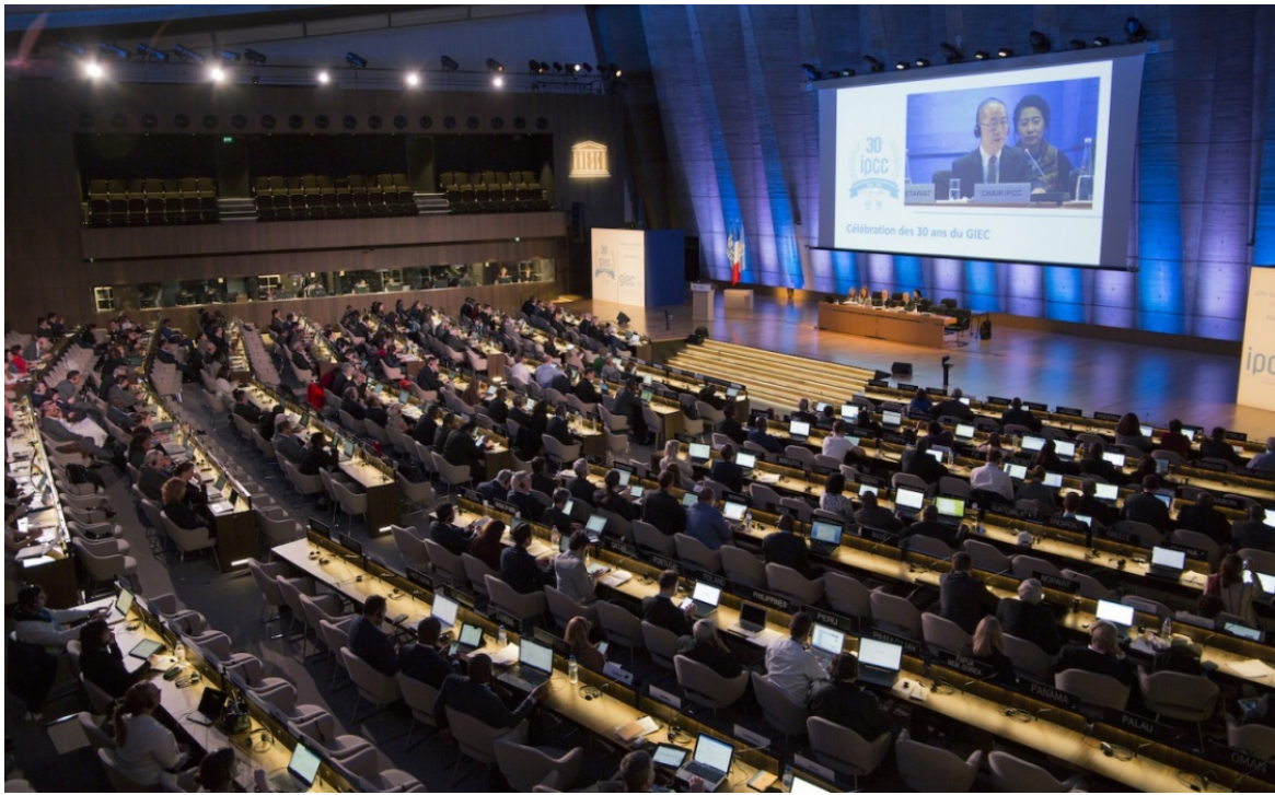
At the 47 th session of the IPCC

The IPCC is currently in its sixth assessment cycle and will be delivering policy-relevant reports every year from 2018 to 2022, except for 2020. The first of these reports, the IPCC Special Report on Global Warming of 1.5°C, will be delivered in October 2018 as per the request of the 2015 United Nations Climate Change Conference (COP21). In 2019, the IPCC will update its methodologies in order for countries to report their emissions in line with the Paris Agreement on the basis of the best science. Two other special reports on land and on oceans will also be delivered in 2019. The Special Report on the Ocean and Cryosphere in a Changing Climate will assess new knowledge related to sea-level risks and options for increasing coastal resilience in both human and natural systems. It will look at water from the mountain top to the sea. During the Sixth Assessment Cycle, the IPCC will also assess many topics related to life on land including desertification, sustainable land management and food security in a Special Report on Climate Change and Land. The full Sixth Assessment Report, including three working group contributions on different aspects of climate change ready in 2021, will be completed with a Synthesis Report in 2022.