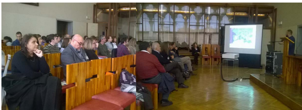
At the workshop

The workshop “THEMES 2017 - Physics and biogeochemistry of marine environments: multiscale analysis of past and present variability” took place in the Ca’Foscari palace of the University Ca’Foscari of Venice, Italy, 15-17 November 2017. The workshop brought together more than 50 (including 20 female) climatologists, ecologists, oceanographers, and modelers from eight countries to discuss the present state of knowledge and the opportunities for progress in measuring, modeling and predicting marine environments. The workshop consisted of nine sessions and a total of 52 talks, including four solicited talks by prominent international scientists, Werner Alpers (University of Hamburg, Germany), Sandro Carniel (CNR-ISMAR, Venice, Italy), Giuseppe Civitarese (OGS-Trieste, Italy), and Georg Umgiesser (CNR-ISMAR, Venice, Italy). Two evening discussion sessions and a closing open discussion paved the way toward improved cooperation between the different groups active in climatological, ecological and oceanographic investigations of our planet. The workshop was co-sponsored by IUGG and IAPSO. More information on the workshop can be found at: http://www.dais.unive.it/~themes/themes_2017/index.html