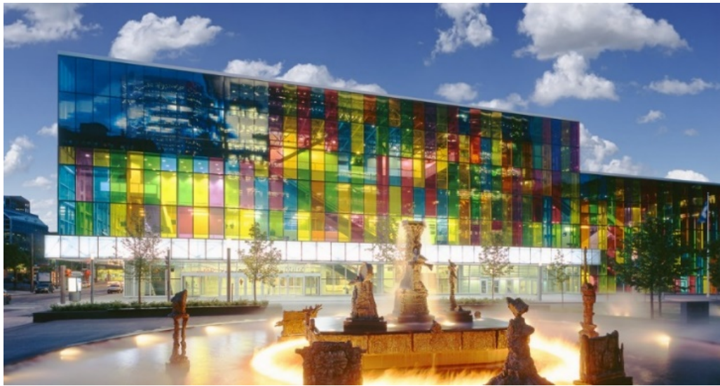
Palais des Congrès, Montréal