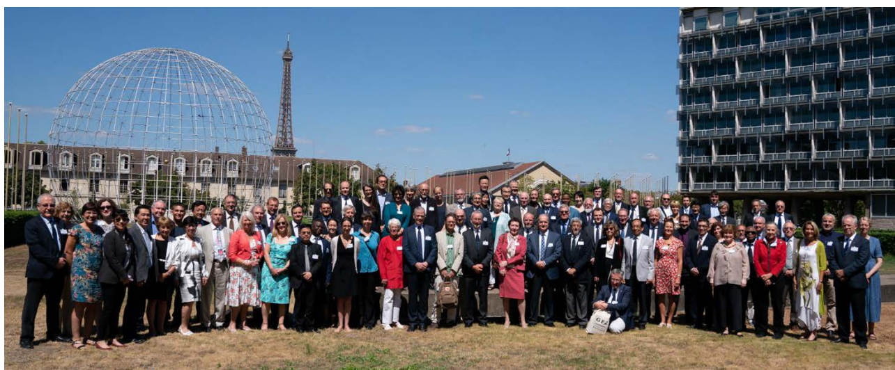
Participants of the IUGG Centennial Celebration Day at UNESCO

Since 1919, IUGG has been advancing, promoting, and communicating knowledge of the Earth system, its space environment, and the dynamical processes causing change. IUGG envisions a future Earth that is environmentally sustainable and where societies are resilient against natural hazards. To achieve this goal, participation in global networks of interdisciplinary programs is vital. IUGG places particular emphasis on the scientific problems of economically less-developed countries by sponsoring activities relevant to their scientific needs. In addition to the many beneficial relationships that IUGG Associations develop with partners, IUGG as a whole also develops and maintains formal contacts with a wide range of organizations, including the International Science Council (ISC) and its international scientific unions and interdisciplinary bodies, UNESCO, and the World Meteorological Organization (WMO).