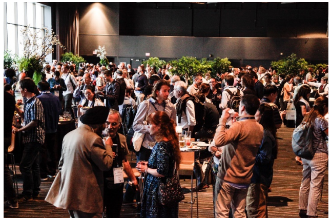
Enjoying Canadian food