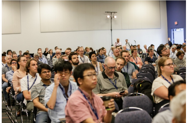
At poster and oral sessions