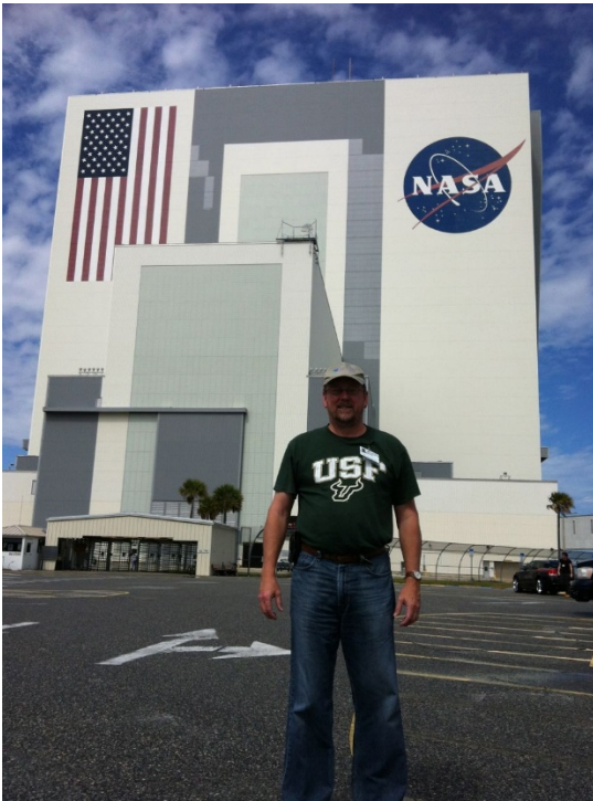
Me standing in front of the building at Kennedy Space Center where the Saturn V rockets were assembled