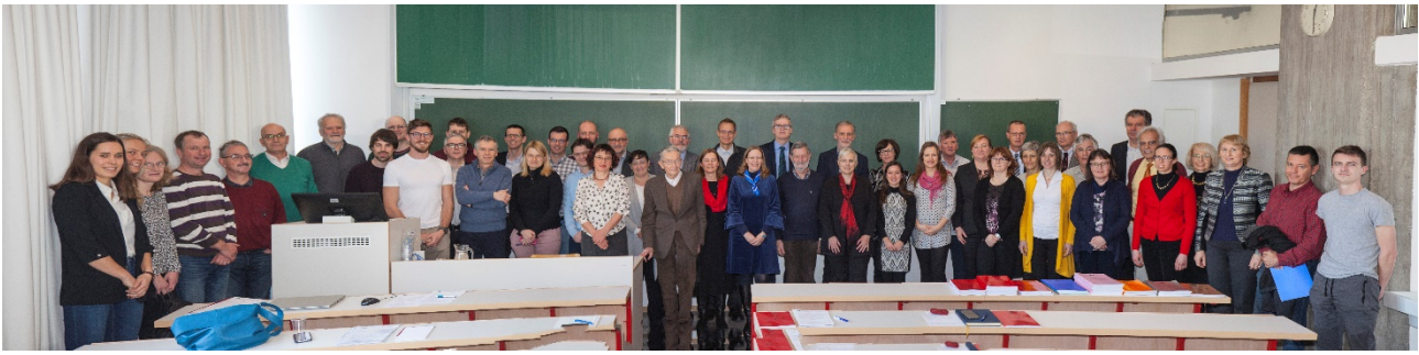
Participants of the 25 th Anniversary of the membership of the Slovenian National Committee in the IUGG