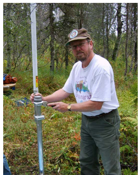
Installing equipment on an antenna mast, Dillingham, Alaska

After college I worked for two years as a research assistant at Lamont Doherty Geological Observatory (now Earth Observatory). The first year was in oceanography and the second in the Alaska project. There I did data reduction in seismology including analyses of seismograms from Pavlof Volcano. I applied and got accepted as a graduate student at