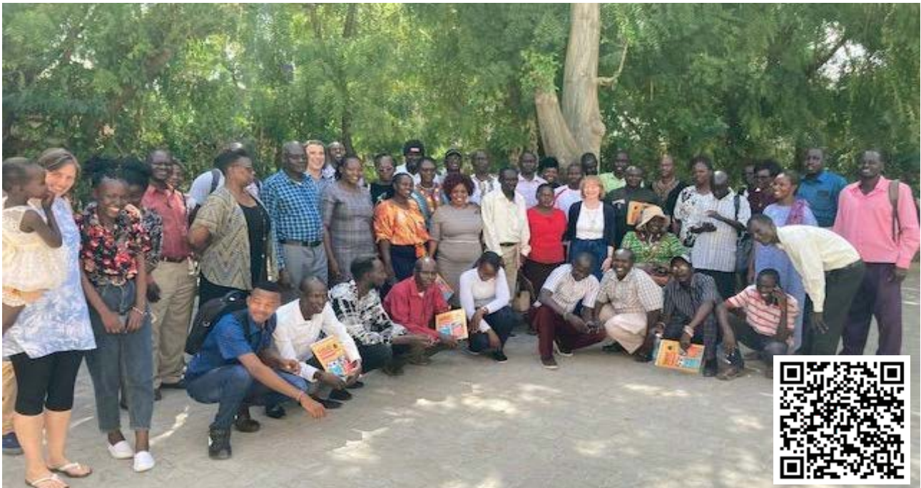
Onsite participants of the two days formative event for teachers