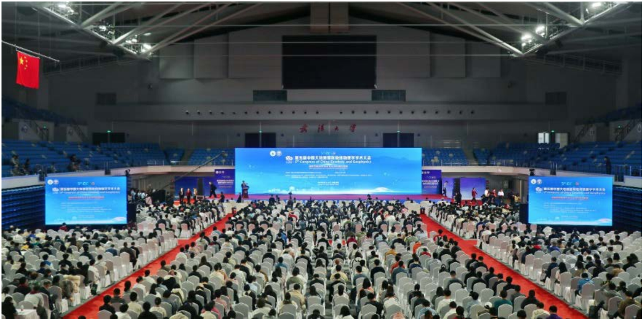
Participants of the 5th CCGG in Wuhan, China

The theme of the 5th CCGG was ‘Earth System Sciences and Large River Sustainable Development’. 16 academicians from the Chinese Academy of Sciences and the Chinese Academy of Engineering, together with more than 3,900 scientists and students from over 300 universities, research institutions and other organisations gathered in Wuhan to exchange their scientific achievements, ideas and visions.