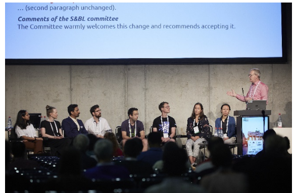
Early Career Scientists Social Event and Panel Discussion