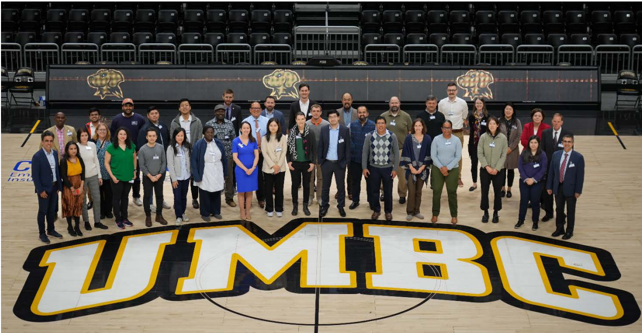
On-site participants of the final workshop and meeting of the Focus Group on AI for Natural Disaster Management