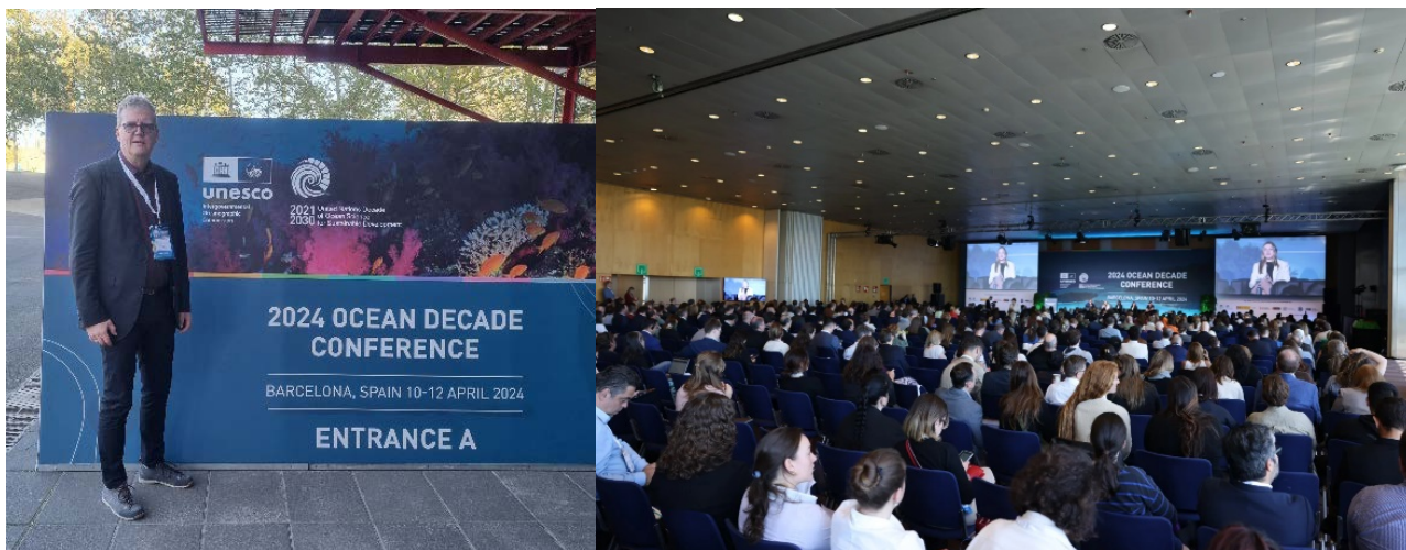
Alexander Rudloff, IUGG Secretary General, attending the 2024 Ocean Decade Conference.

In April 2024, three years after the start of the UN Decade of Ocean Science for Sustainable Development (2021-2030), the Ocean Decade community and its partners were called to celebrate achievements and set joint priorities for the future of the Decade. Hosted by Spain, and co-organised with UNESCO's Intergovernmental Oceanographic Commission (IOC/UNESCO) in close collaboration with the Region of Catalonia and the Barcelona City Council, the 2024 Ocean Decade Conference took place from 10 to 12 April 2024 in the city of Barcelona, Spain. The event was attended by around 1,500 participants from 124 countries.