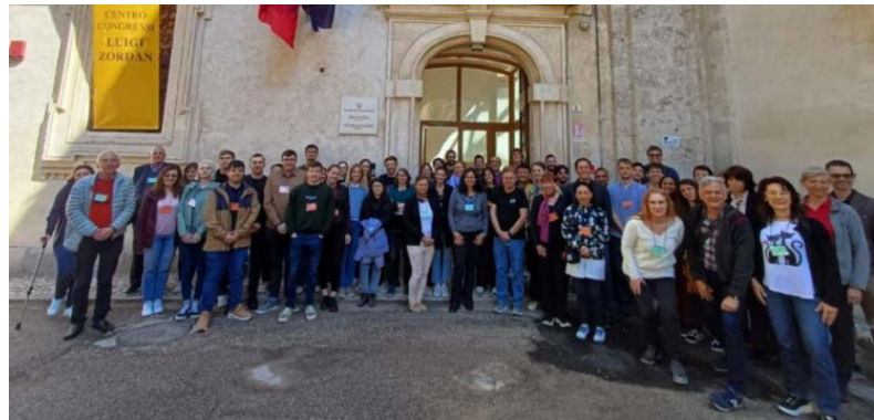
Participants of the School on ‘Operational Space Weather Fundamentals’

The IUGG contribution was used to allow three non-European students, who had provided a valid reason for requesting financial support and had an adequate academic record, to participate in the school free of charge or at a reduced fee.