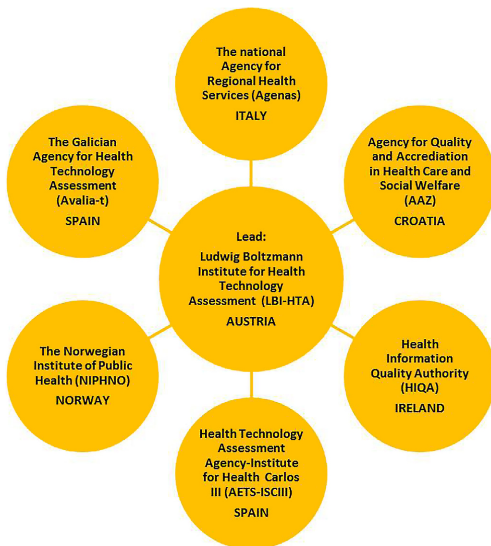
Fig. 3 Activity Centres for managing collaborative assessments of “other technologies”