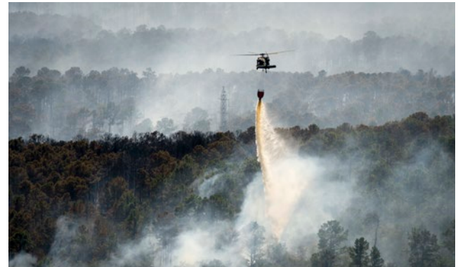
A Texas Army National Guard UH-60 Black Hawk helps fight wildfires.

The CPG addresses preparation and review of contingency and campaign plans, including homeland defense and military support to civil authorities. The 2021 CPG includes prioritization of severe weather challenges to war plan development, and future CPGs will include consideration of other aspects of climate change.