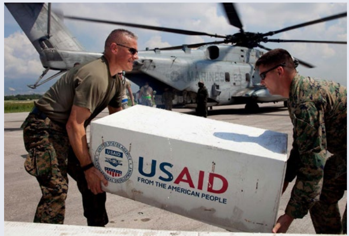
DoD supports the US Government Assistance to Haiti after Hurricane Matthew in 2016.