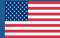
United States of America