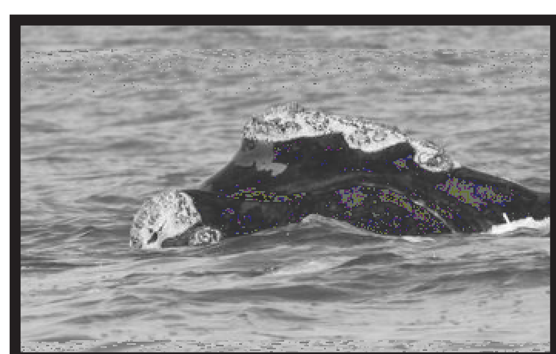
White Marking on Head