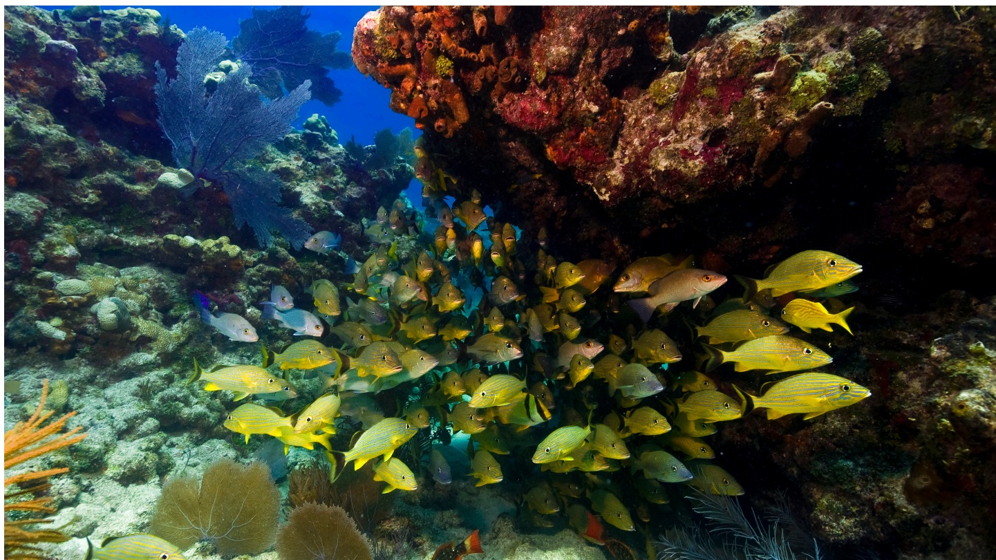
Coral, Florida Keys