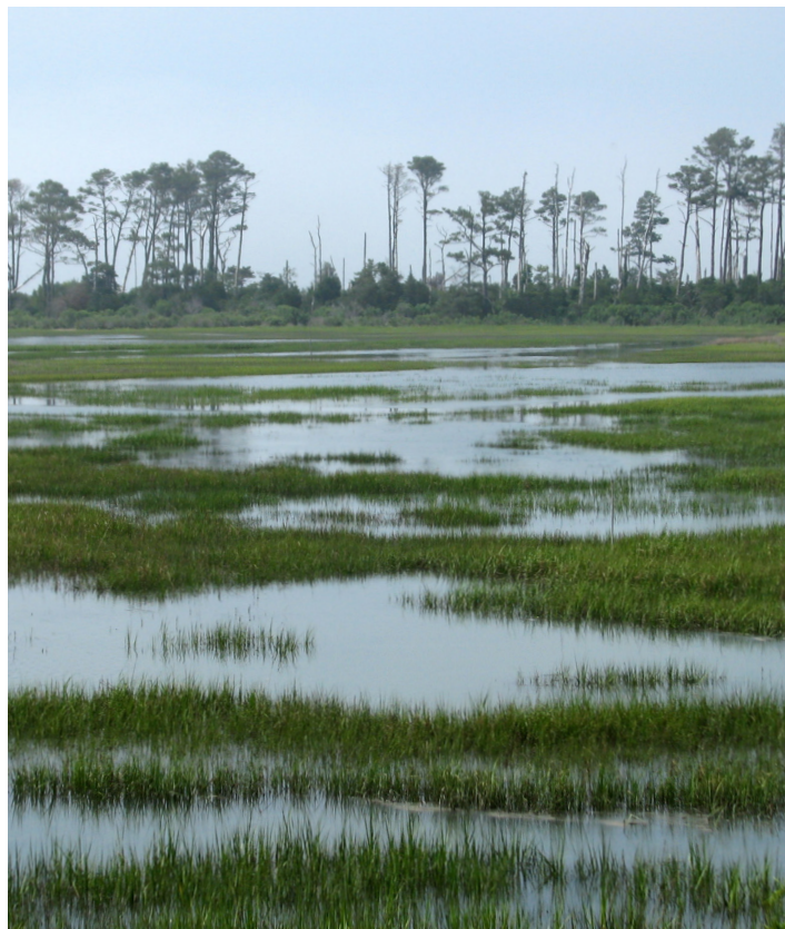
Eastern Shore, Virginia

Design a hybrid living shoreline breakwater to minimize further erosion of a peninsula on the west side of the Maurice River and plan the protection and restoration of a second vulnerable location on the east side of the river. Project will develop engineered designs, construction methods, permits and cost estimates in preparation for wetland restoration construction.