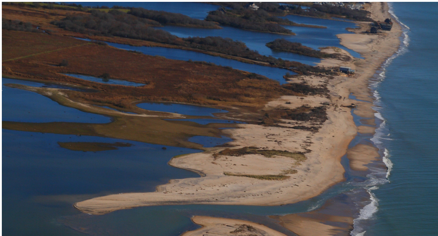
Trustom Pond, Rhode Island, after Hurricane Sandy in 2012