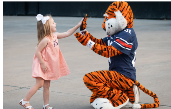
Photo backgrounds should be clutter-free. Out-of-focus backgrounds can be used to separate the subject from the background.