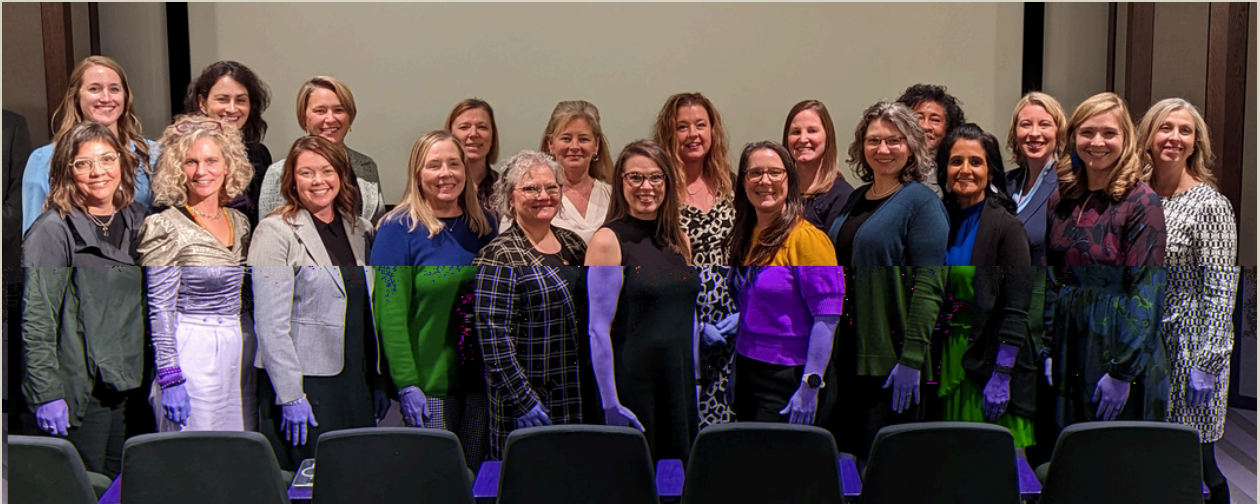
Members of the 2023 WELD program

“The relationships that the WELD cohort build among themselves last well beyond the end point of the program, and the UK community is stronger because of the trust and respect that are established during those months together. Building the future leaders of this university depends on making investments now in faculty and staff members who can envision one day taking on greater responsibility on this campus.”