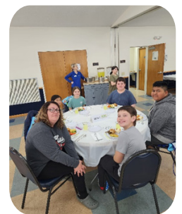
Owen County 5th Grade Students, Recipes for Life 2023