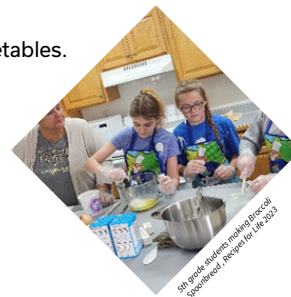
5th grade students learning practical food preparation. Recipes for Life 2023