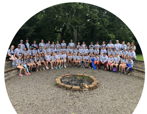
2022 4-H Summer Camp Group Photo North Central 4-H Camp, Carlisle, KY