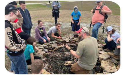
Lake Cumberland 4-H Outdoor Adventure Camp 2023 Nancy, KY