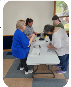
Self Care Series Candle Making

The third and final night consisted of candle making and a discussion recapping types of self-care, the importance of self-care, and preventing stress and its effects through self-care. Participants were able to make soy jar candles to take home to add to their self-care routine. Participants were surprised at how easy it was to make the candles and thoroughly enjoyed the evening. The UK handout, Calming the Storm Preventing Distress Self-Care Checklist, was provided to participants.