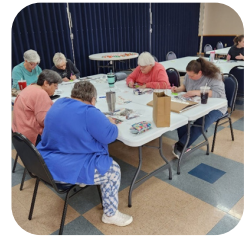
Self Care Series Diamond Art

On the first evening, different types of self-care and pinpointing feelings were discussed, giving participants a variety of ideas to consider regarding self-care. A handout that discussed what self-care is and why it is important was provided to participants along with a handout of a feelings wheel. The first craft chosen was diamond art. This is a fun and addicting craft that can be done in both smaller projects as well as larger ones, depending on the individual. The diamond art provided was one that no one in the class would be able to complete, allowing participants to be able to take home the project to finish later, giving them self-care options to work on after the class. It was expressed by multiple participants that they enjoyed the diamond art so much, they had purchased and completed more since the class as part of their new self-care routine.