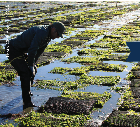
below: FARMER INSPECTING THE OYSTER BEDS

multi-billion dollar global industry. With substantial intertidal and offshore ocean areas ideal for cultivation, our state’s shellfish industry could supply a substantial local and export market.