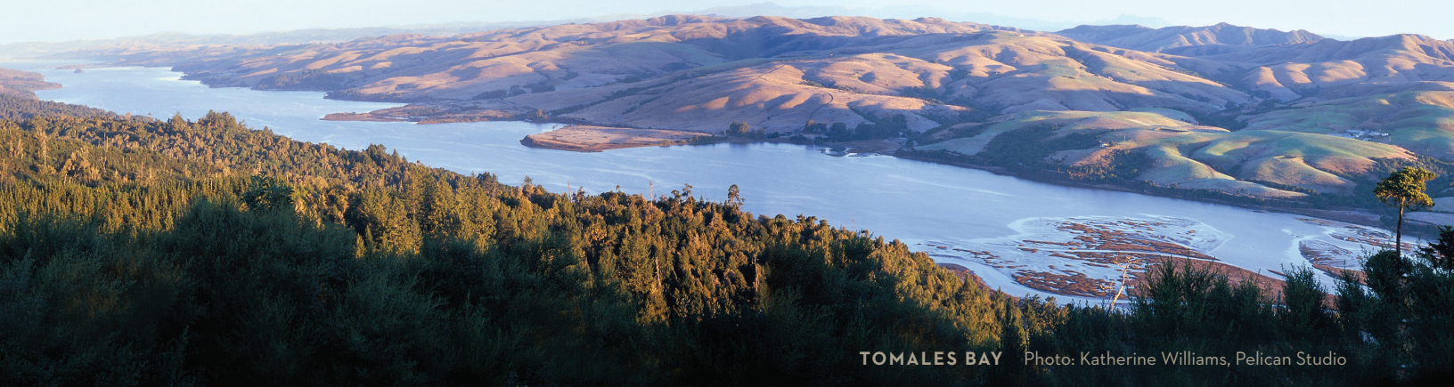
TOMALES BAY