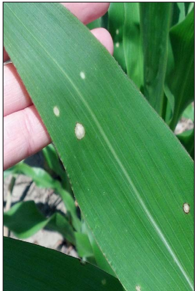
FIGURE 1. HOLCUS LEAF SPOT LESIONS.

One of the challenges to diagnosing holcus leaf spot is that the disease symptoms can be confused with exposure to off-target movement of contact-type herbicides. Paraquat is one example of a broad-spectrum contact herbicide, meaning that it has efficacy on all plant species and only affects the parts