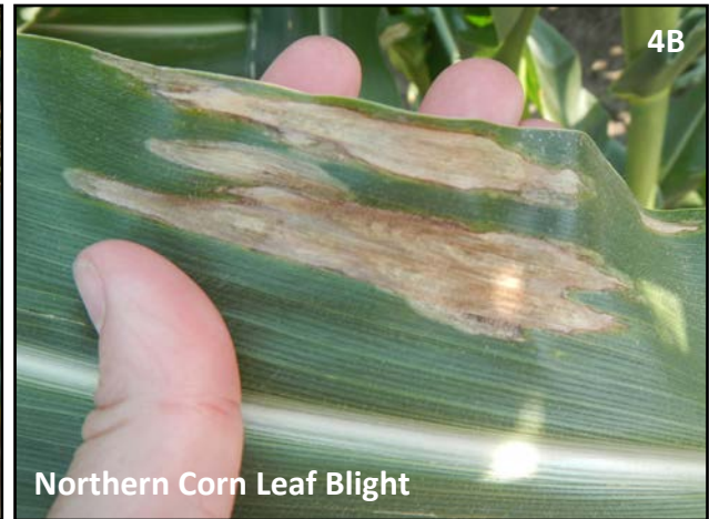
FIGURE 4. DIPLODIA LEAF STREAK LESIONS (A) CAN RESEMBLE THE ELLIPTICAL LESIONS OF NORTHERN CORN LEAF BLIGHT (B).