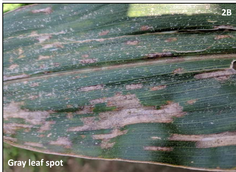
FIGURE 2. LESIONS EXPAND INTO LONG STREAKS ON THE LEAVES (A) AND CAN BE CONFUSED WITH LESIONS OF GRAY LEAF SPOT (B). FIGURE 3. SMALL BLACK FUNGAL STRUCTURES (PYCNIDIA) MAY BE OBSERVED WITHIN LESIONS (A&B).