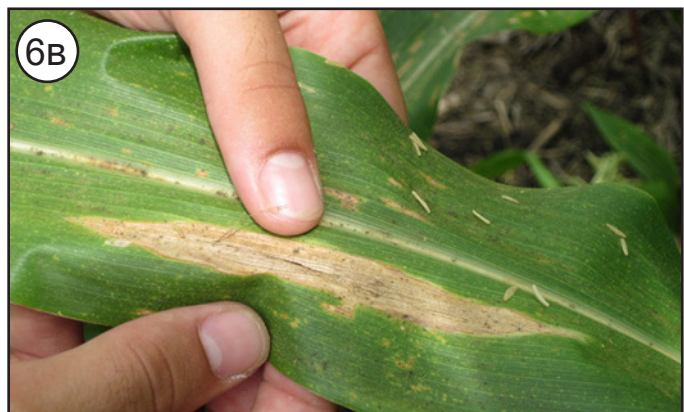
FIGURE 3. ON SUSCEPTIBLE VARIETIES, NORTHERN CORN LEAF BLIGHT LESIONS CAN EXPAND TO OVER 6 INCHES IN LENGTH.