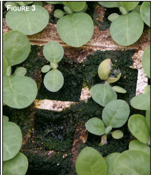
FIGURE 2. STEM AND LEAF ROT OF TOBACCO SEEDLINGS CAUSED BY R. SOLANI . FIGURE 3. LEAF INFECTION CAUSED BY R. SOLANI .

A common inhabitant of agricultural soils, R. solani can survive on organic matter and will colonize growth media used in tobacco transplant production. The abundance of water and humidity in the float system makes it an ideal location for disease development. Primary infections occur when actively growing fungal threads (hyphae threads) come in contact with roots or stems. Hyphae form infection structures that produce enzymes, which in turn degrade plant tissues. The disease can spread from plant to plant, and organic matter (plant debris) can serve as a bridge between infected and healthy seedlings.