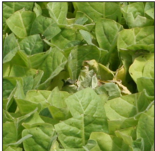
FIGURE 1. EARLY SYMPTOMS OF COLLAR ROT INCLUDE YELLOWING OF LEAF TIPS AND FLAGGING OF OLDER LEAVES.

Signs of the causal fungus may be present on symptomatic plants or on debris in float trays. These include a white, cottony fungal mass (mycelium), which is present if humidity is high. Irregularly shaped, black sclerotia (FIGURE 4), which resemble seeds or rodent droppings, are the primary survival structure of the pathogen and become apparent in later stages of disease development. Sclerotia are the primary source of disease-causing inoculum in subsequent years.