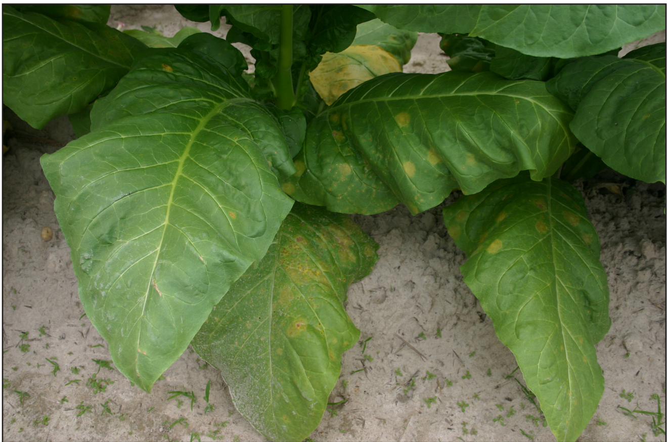
FIGURE 2. ORANGE-YELLOW LESIONS ON TOP SURFACES OF TOBACCO LEAVES IN THE FIELD.

By using alternate modes of action, growers may preserve the efficacy of fungicides as powerful disease management tools for many growing seasons to come.