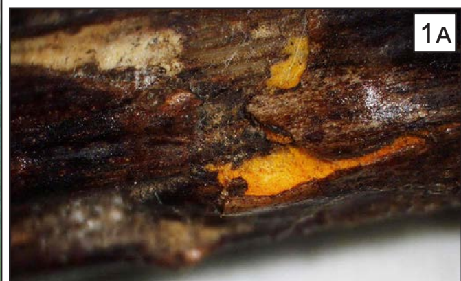
FIGURE 1. (A) CANE AND LEAF RUST PUSTULES ERUPT THROUGH THE BARK OF FLORICANES IN SPRING. (B) CLOSE-UP OF CANE AND LEAF RUST PUSTULE CONTAINING ABUNDANT POWDERY YELLOW SPORES.