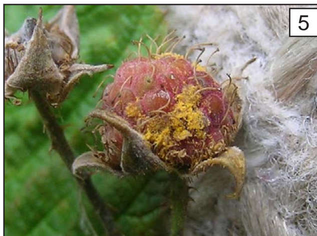
FIGURE 5. LATE RUST CAN AFFECT DRUPELETS OF FALL FRUITING RASPBERRY.

Late rust is caused by Pucciniastrum americanum , a fungus with two possible life cycles and several spore types. Generally, the fungus overwinters in infected canes. Infective spores (urediniospores) are released in spring and throughout the growing season. Spore production is highest when conditions are wet. Disease spreads when fungal spores are carried by air currents. Leaves, fruit, and primocanes (current year canes) become infected in summer and autumn. An alternate host, white spruce, can play a role in the disease cycle by producing different spore types (aeciospores, basidiospores); however, it is unlikely that white spruce is part of the disease cycle in Kentucky.